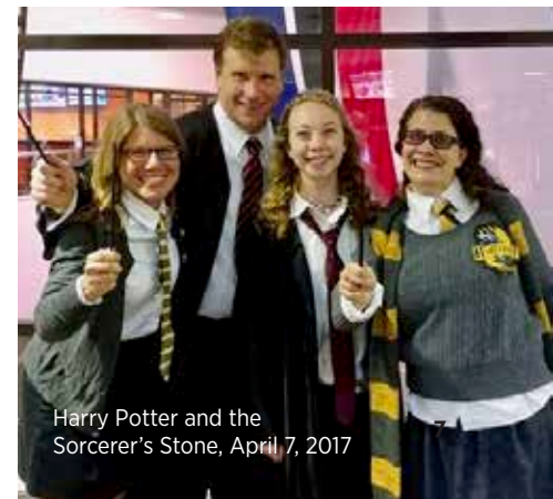
Harry Potter and the Sorcerer's Stone, April 7, 2017