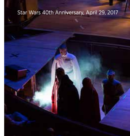
Star Wars 40th Anniversary, April 29, 2017