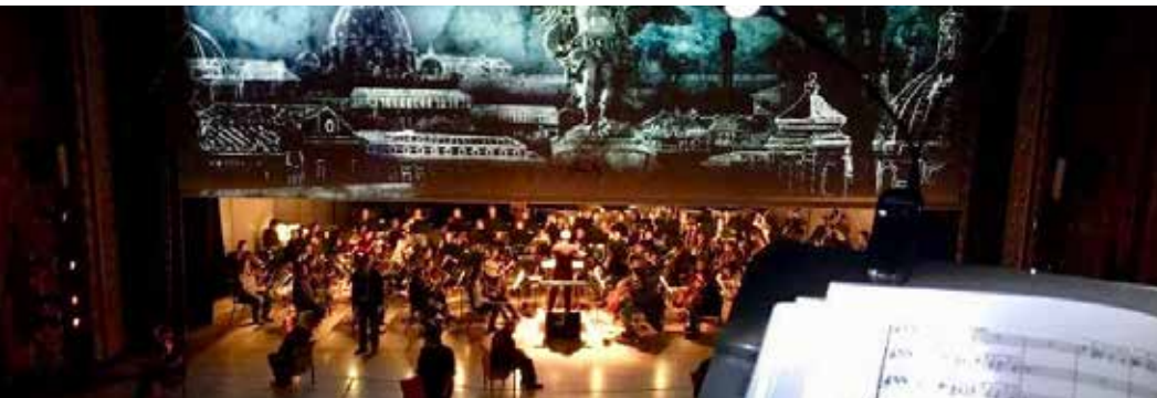
Opening Night: Olga Kern Plays Rachmaninoff, October 1, 2016 (top left) | Tosca, February 4, 2017 (below)