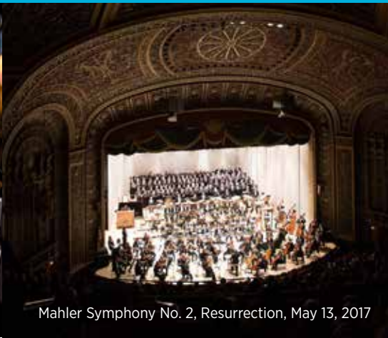
Mahler Symphony No. 2, Resurrection, May 13, 2017