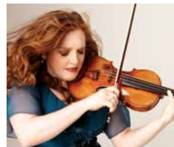
RACHEL BARTON PINE

SAME SEAT DEADLINE IS MARCH 15, RENEW TODAY!