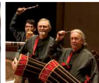
D'DRUM WORLD PERCUSSION