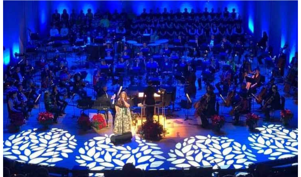
Holiday Pops, December 21, 2019