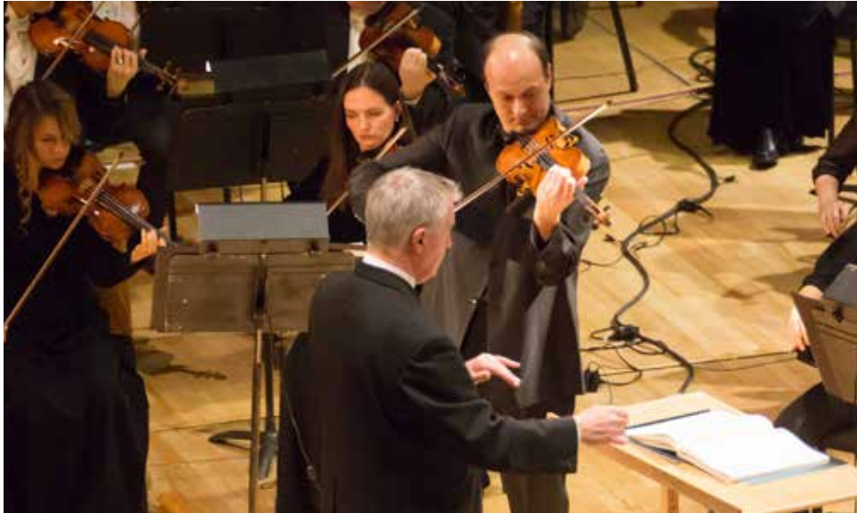
Violins of Hope, Embassy Theatre, November 23, 2019