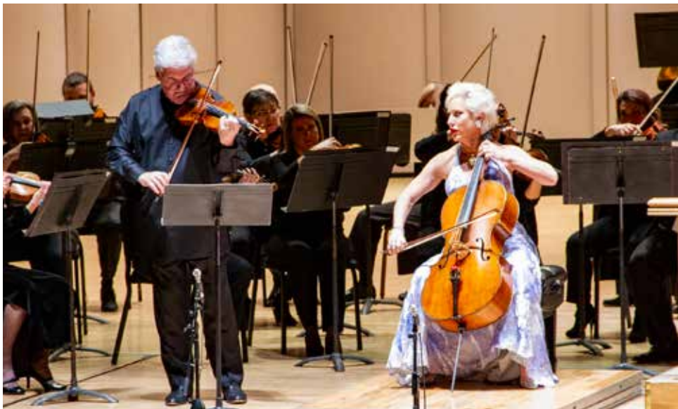
Pinchas Zukerman Plays Brahms, February 1, 2020