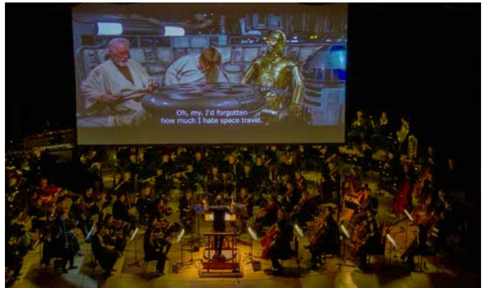
Star Wars: A New Hope in Concert, February 26, 2020