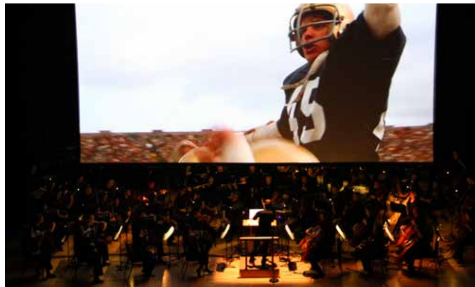
Rudy In Concert, October 12, 2019