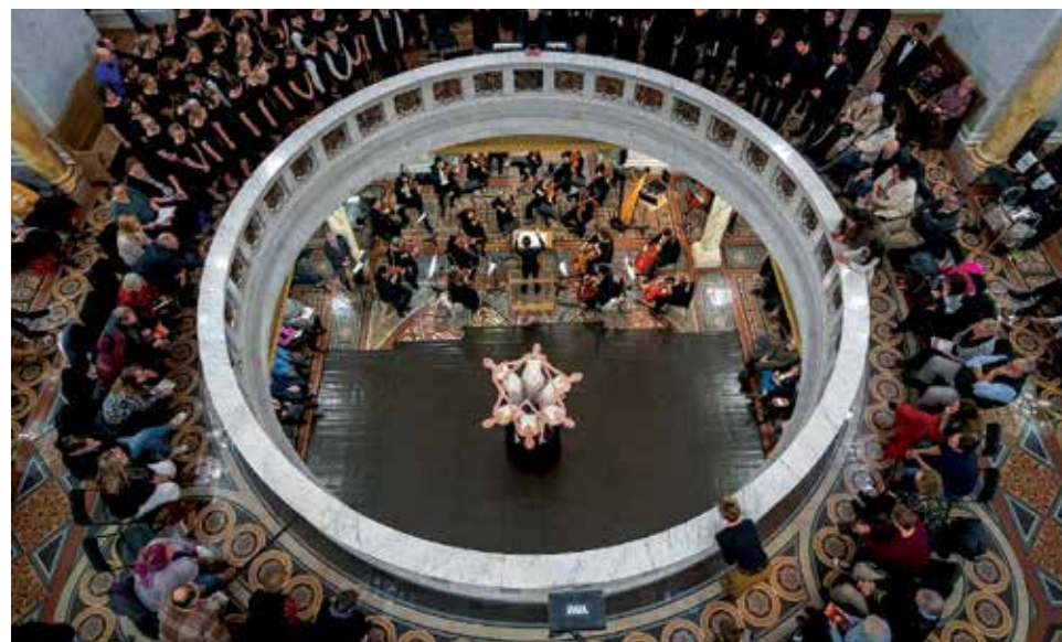
Violins of Hope at the Allen County Courthouse, November 14, 2019