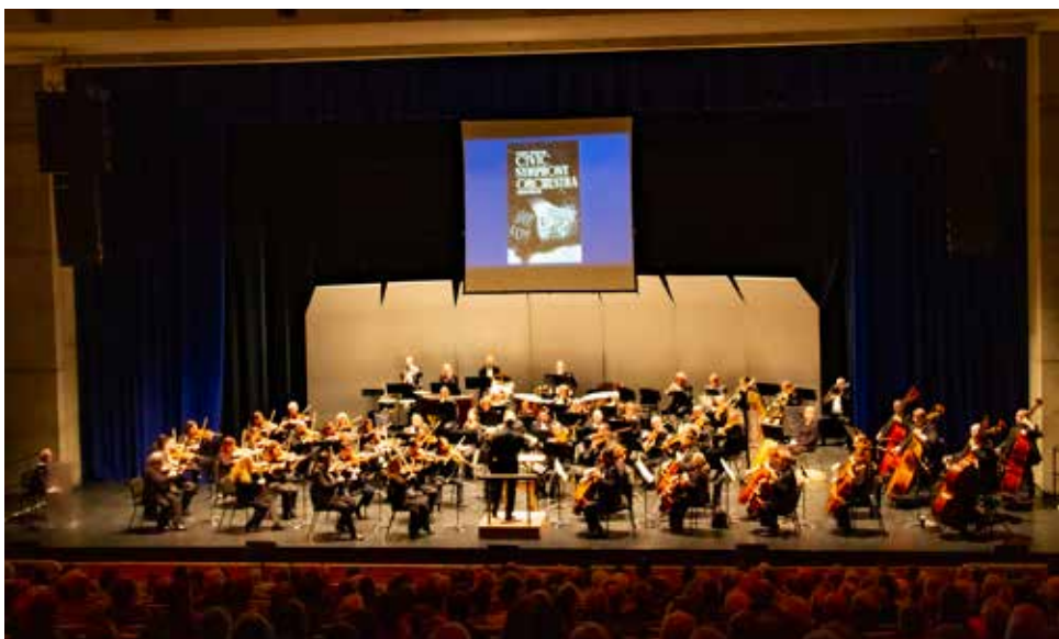
75th Anniversary Birthday Bash, October 18, 2019