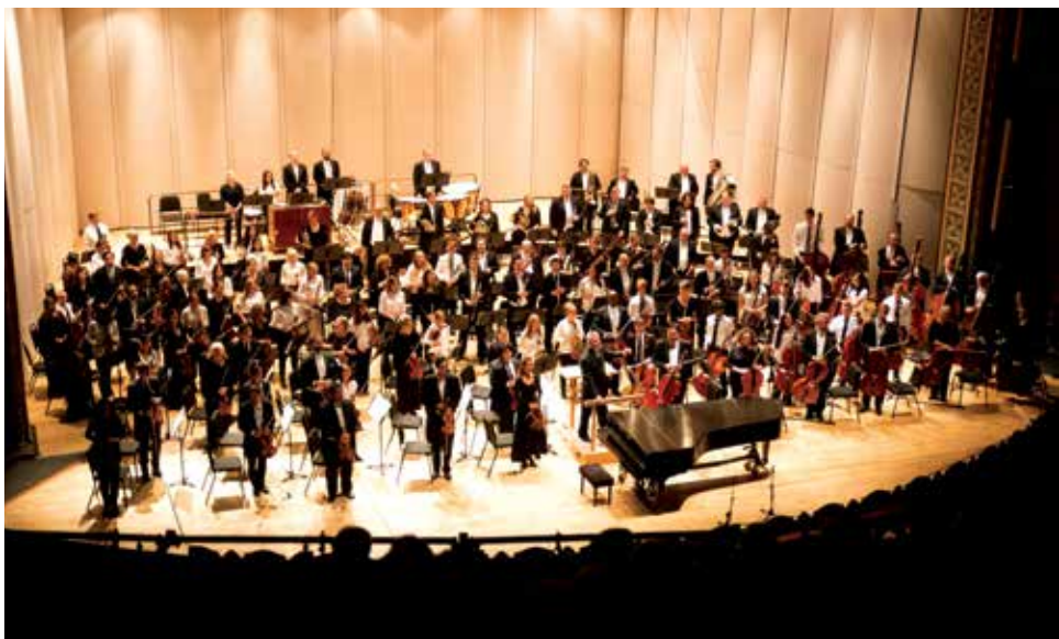
Opening Night - Tchaikovsky Spectacular, October 5, 2019